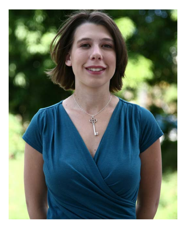
Assistant Attorney General Amber Robinson

Table 4.4-54 Impact on Public Safety Service Population Summary (Unconstrained) indicates that the current population serviced by the Guam Police Department is 160,797, and that the department will service 100% of the population increase. The OAG is the only Government of Guam legal entity that services our island and the island's various government agencies. It can be assumed that the OAG, in general, will also service 100% of the population increase on the island, which would mean that the percentage increase for the OAG would be at about 49% during the peak year (2014) and then it would drop to about 21% after the construction related-projects have been completed thereafter.