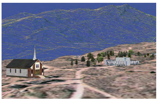
knowledge and resources.

SGTT philosophy is to access knowledgeable staff from across Sandia to maintain a virtual team with broad