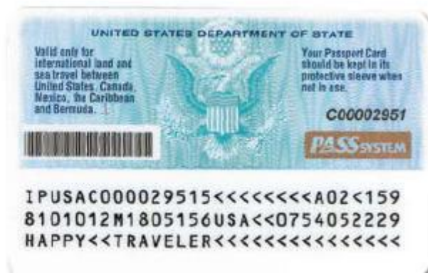
Passport Card front and back