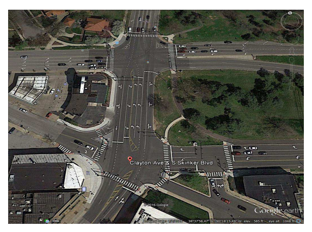
Improvements Accomplished from Local Gaming Revenues

Clayton Avenue and Skinker Boulevard Interchange