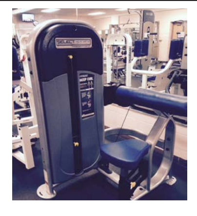
Diane Sayre Recreation Center Fitness Equipment

Total Capital Investment in Property since Company Purchase: $59,425,700 Total Capital Investment in Property for Fiscal Year: $1,052,047 Total Employee Compensation: $7,493,504 Real Estate/Personal Property Tax: $335,533 State Sales Tax: $134,845 State Withholding Tax on Jackpots: $180,849 Federal Withholding Tax on Jackpots: $173,359 Charitable Donations: $11,916 Total Employment: 228 Minority Employment: 68 Female Employment: 126