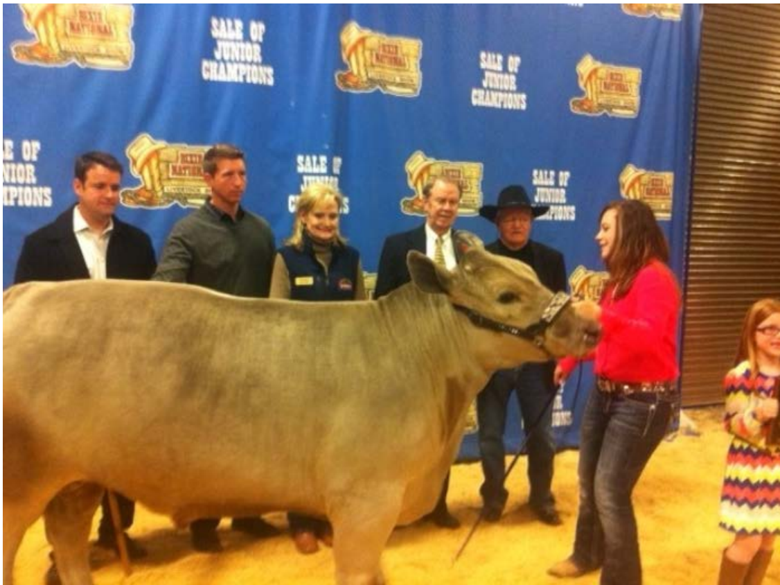
Commissioner Chaney and Commissioner of Agriculture Cindy Hyde-Smith reviewed livestock at the Dixie National Rodeo and Livestock show in Jackson, MS.

Internal Review — The review of the insurer's determination that a requested or provided health care service or treatment health care service is not or was not medically necessary by an individual(s) associated with the health plan. PPACA requires all plans to conduct an internal review upon request of the patient or the patient's representative.