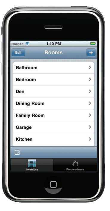
3. Select a room