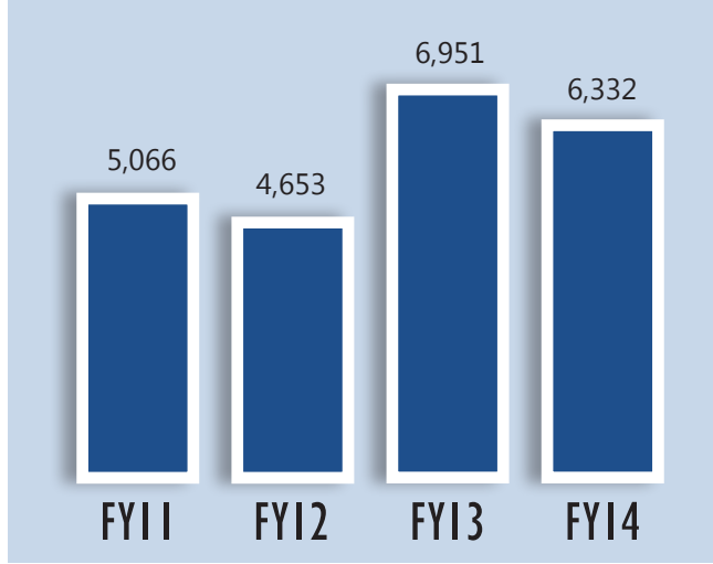
Performance Measure Two: Mediation Requests Filed FY11-FY14

Although the filing of the foreclosure action is outside the direct control of the Judicial Branch, the disposition of the foreclosure matter may be influenced by the ability to find an equitable outcome between the lender and the borrower through the Foreclosure Mediation Program. Historically, the Program has met its objective of facilitating negotiated settlements.