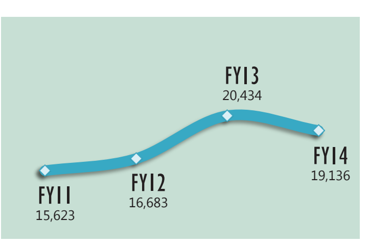
Performance Measure One: Foreclosures Filed FY11-FY14

Total Program Funding: FY15 = $5,902,565