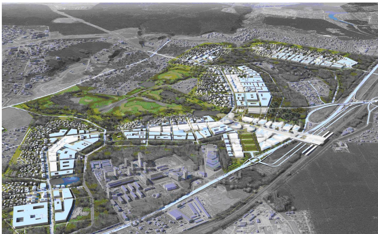
Figure 3 - Bird's Eye View of Skolkovo (Artist's Conception)<sup>2</sup>

Although the Skolkovo Innovation Center has begun operation, it remains a work in progress. The physical complex is still under construction, and the Skolkovo Foundation is still recruiting staff, students, and partner companies. According to Skolkovo Foundation Vice President Seda Pumpyanskaya, the Foundation expects that the complex will be only one-third complete when it hosts the G8 Summit in 2014. Pumpyanskaya indicated that "the project will have three stages, with the commissioning deadlines in 2014, 2017, and 2020," and will eventually have about 30,000 employees. Figure 3 shows the ambitious architectural plan for the entire facility. However, there are many reports indicating that the center will likely continue to miss its targets for construction, foreign investment, the pace of grant transfers, and combating corruption. 17,18,19,20,21,22,23,24,25,26,27,28