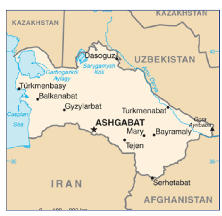
Turkmenistan map

The INCSR reports that although some progress has been made, Turkmenistan is still not in full compliance. President Berdymukhammedov