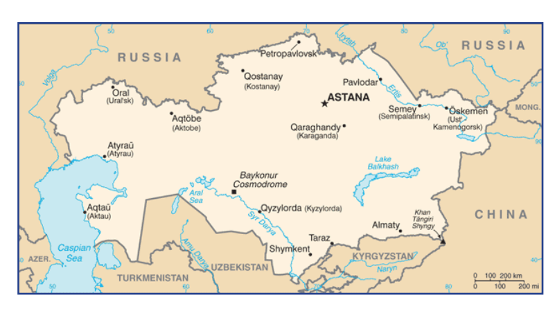
Kazakhstan map

In declaring that cooperation with the UN is "one of the priorities of the state foreign policy," Kazakhstan intends to comply with international legislation. This embraced relationship is evidenced in that 16 organizations are represented by the UN in Kazakhstan, including the UNODC. In addition, Kazakhstan has achieved a number of tasks of