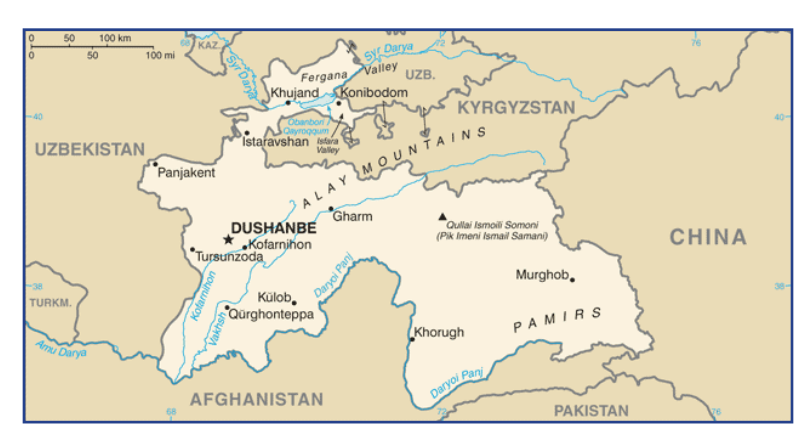
Tajikistan map, via CIA World Factbook

Tajikistan has complied with international treaty obligation and legislative requirements by establishing its proprietary Drug Control Agency by presidential decree in June 1999, in accordance with the Protocol between the Republic of Tajikistan and the United Nations Office for Drug Control and Crime Prevention. This governmental agency is the "public authority re-