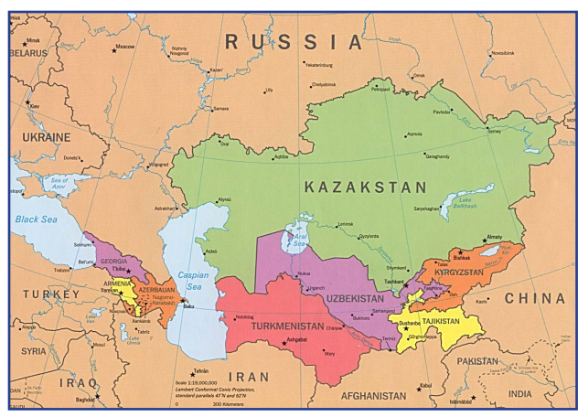
Caucasus and Central Asia map

The link between terrorist activity and the illicit drug trade is becoming more and more evident, which significantly affects stability and security in the Central Asian region. The United Nations Security Council (UNSC) expressed "strong concern (emphasis added)... [due to the] increased violent and terrorist activities by the Taliban, Al-Qaida, illegally armed groups, criminals and those involved in the narcotics trade, and the increasingly strong links between terrorism activities and illicit