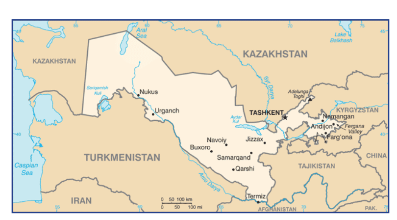
Uzbekistan map

The Republic of Uzbekistan complied with treaty obligation and international law in a series of measures. Uzbekistan established its proprietary State Drug Control Commission in April 1994, and, by decision of the Cabinet Ministers, transformed it into the National Information Analysis Center for Drug Control in 1996 to strengthen law-enforcement agencies combat-