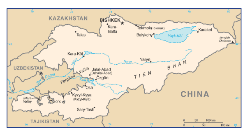
Kyrgyzstan map

Kyrgyzstan (also referred to as the Kyrgyz Republic) has complied with its obligations to the UN conventions by first establishing the State Commission of the Republic of Kyrgyzstan for Narcotics Control (GKKN) in 1993, as the state authority implementing state policy in the sphere of licit trafficking in narcotic drugs and psychotropic