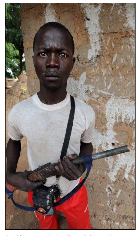
An African combatant brandishing a homemade rifle.

pipe, screw, tape, and firing mechanism, and they usually take the form of a pistol or shotgun. Despite the otherwise rugged appearance, these weapons are easy to use and are effective in combat situations. Though they are capable of only a single shot, artisans have devised a system of expedient reloading whereby the user simply rotates the barrel 180 degrees, which simultaneously ejects the used cartridge while the user chambers a new one. 17 The basic construction, mechanics, and pragmatism afforded by these rudimentary firearms make them popular among youth and common criminals, as they are easy to disassemble, disposable, untraceable, and substantially cheaper than regular or replicated firearms. A basic craft pistol sells for about US$7, with primitive shotguns fetching the equivalent of about US$100 in the markets in West Africa.<sup>18</sup>