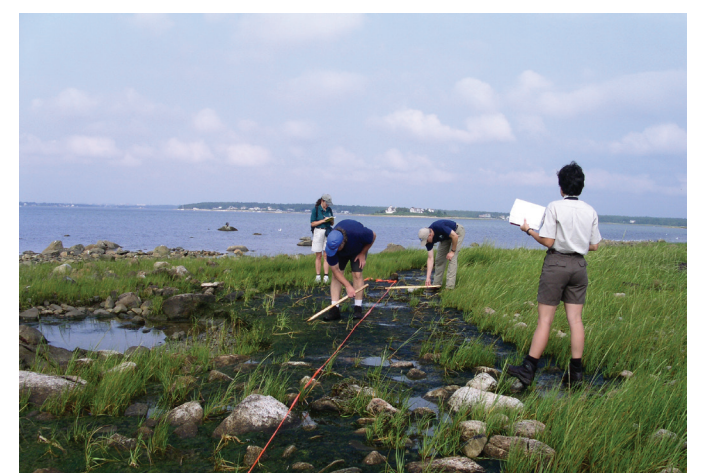
Marsh injury assessment, Long Point, Fairhaven, Mass., September 2003.

Natural resource services are the functions performed by a natural resource that benefit other natural resources and/or the public. To complete the analysis, the Trustees used commonly accepted natural resource damage assessment scaling methods. For the ecological injuries (e.g., aquatic resources, birds) these methods included what is known as habitat equivalency analysis (HEA) and resource equivalency analysis (REA), while for the lost human use injuries, Trustees employed non-market economic valuation approaches (e.g., shellfish license demand analysis, benefit transfer) combined with data on visitation and use. These techniques are commonly used to measure the value of ecosystem resources and services and to estimate the amount of restoration required to compensate the public for the oil spill impacts.