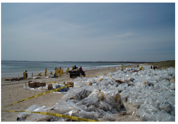
Oiled beach cleanup, Dartmouth, Mass., April 2003.

The Shoreline TWG damage assessment work focused on injuries associated with the oiling and also injuries caused by the clean-up, such as trampling of marsh and dune vegetation, and increased erosion in marsh areas. The Shoreline TWG evaluated the extent and duration of injury to shoreline natural resources using Shoreline Cleanup Assessment Techniques (SCAT) and other survey data collected immediately following the spill or otherwise available for use in the assessment. A pre-assessment data report (June 2005) identified resources potentially at risk of injury including shoreline and other types of resources. The surveys indicated that rocky, boulder and cobble shoreline suffered the most extensive oiling, followed by sand beaches and marshes. In total, oil adversely affected an estimated 84.7 acres (along 87.2 miles) of the Massachusetts shoreline and an estimated 13.8 acres (along 17.7 miles) of the Rhode Island shoreline.