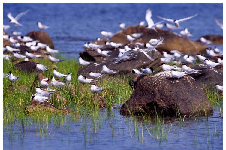
Group of terns loafing on the rocks.