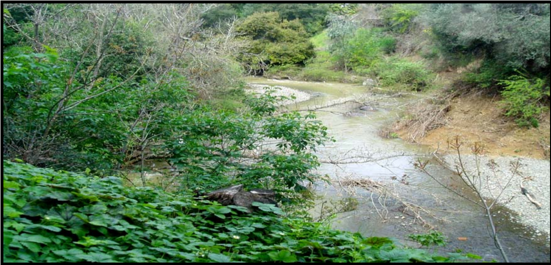
Riparian restoration through removal of invasives and planting native vegetation.