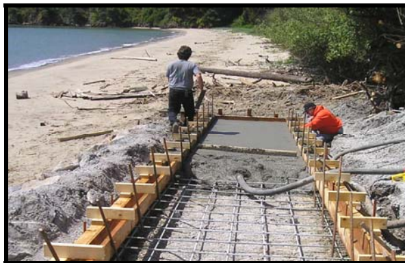
ADA ramp construction at Quarry Beach.

The Quarry Beach access has been completed. The additional work needed on the trail leading to the Perle's Beach stairs as well as stabilization at the top of the stairs will be performed pending the scheduling of other work in the area.