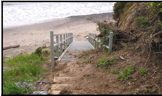
Stairs to Perle's Beach.

This project involves the construction of stairways, walkways, and trail improvements to enhance public access to beaches on Angel Island that were closed to the public because of the oil spill.