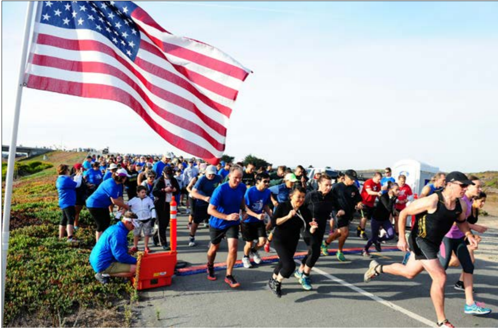
Runners cross the starting line of the five-kilometer course during the third annual Honor Our Fallen 5K & 10K Run/Walk event at Fort Ord Dunes State Park, Oct. 24.