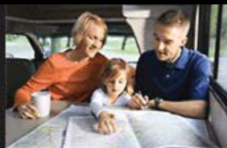
MAKE A PLAN