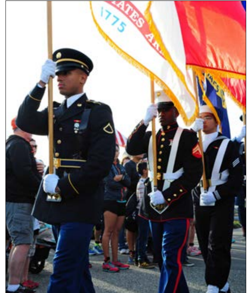
The Honor Joint Service Color Guard from the Defense Language Institute Foreign Language Center parade the colors during the ceremony prior to the third annual Honor Our Fallen 5k & 10K Run/Walk event.