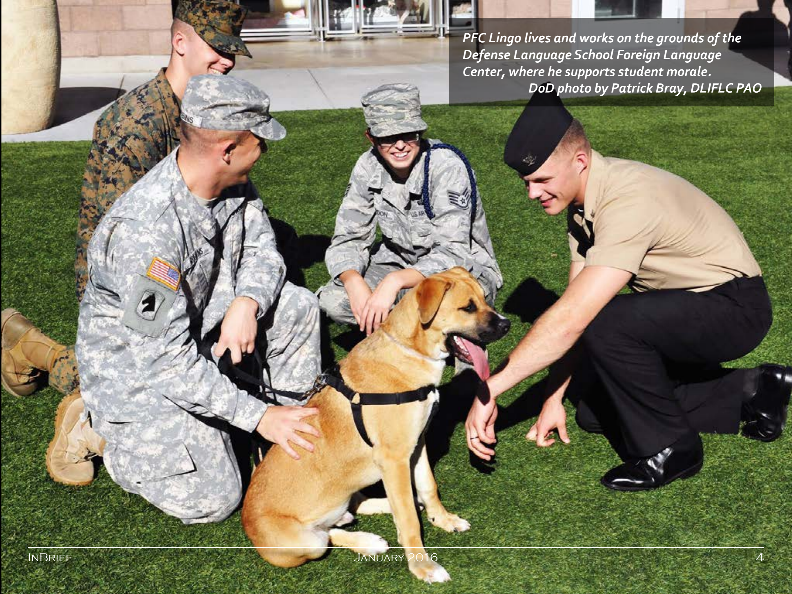
PFC Lingo lives and works on the grounds of the Defense Language School Foreign Language Center, where he supports student morale.