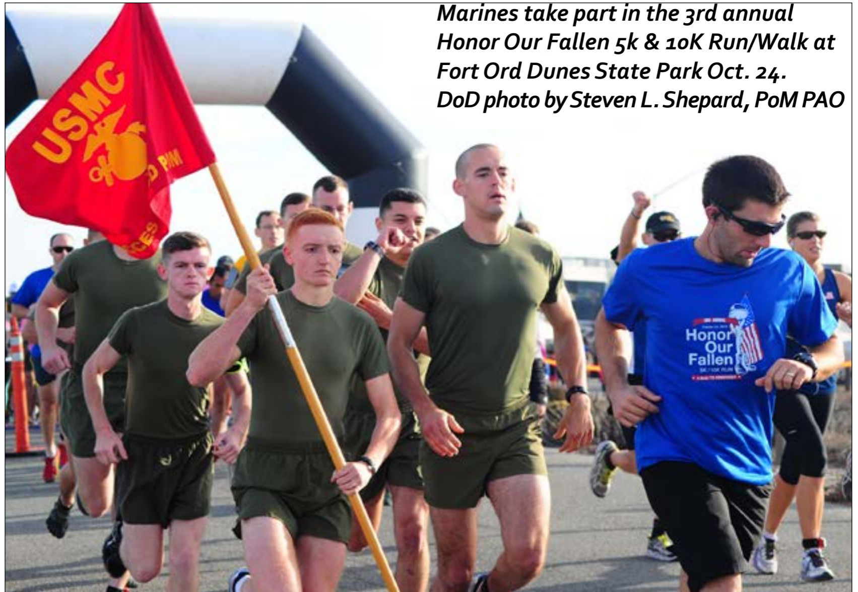
Marines take part in the 3rd annual Honor Our Fallen 5k & 10K Run/Walk at Fort Ord Dunes State Park Oct. 24.

Jimmy Panetta, Navy veteran, deputy dis-