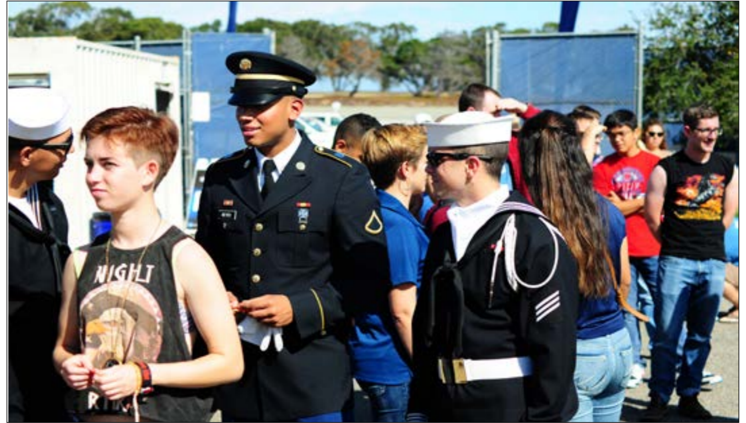
CSU at Monterey Bay thanked military members for their service with a Military Appreciation Day during a CSUMB "Otter" soccer double-header.