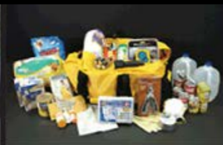
BUILD A KIT