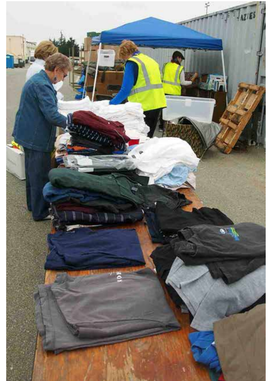
Donated clothes and towels are sorted and displayed Aug. 19 for Veteran's Transition Center Stand Down attendees to take with them upon departure.