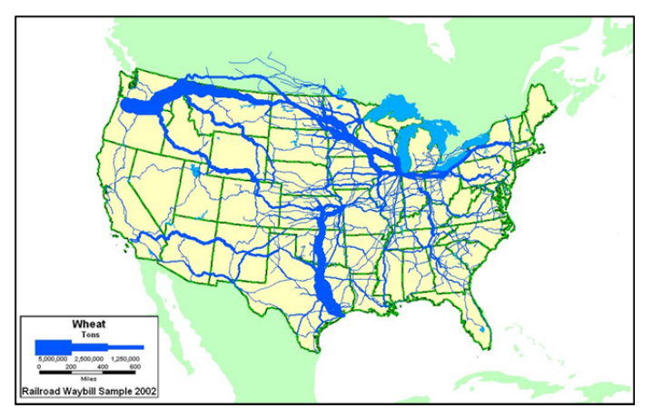
Domestic and International Wheat Flows in the United States

ORNL has performed numerous studies for different government agencies on commodity freight flows. An example of this is a recent study for the Department of Homeland Security on the food supply chain. We used the ORNL freight flow analysis data to map flows of different commodities and determine the vulnerabilities in the supply chain.