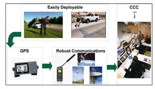
Traffic sensor system for emergency evacuations.

The proposed system is composed of detectors that are engineered in such a way that they can be rapidly deployed in the field (e.g., taped to the roadway or through other means) at key points. Each one of these fast-deployable sensors is equipped with Global Position System (GPS) devices to auto-determine their spatial location on the transportation network under surveillance, and will assess traffic parameters by identifying specific vehicles in the traffic stream. The system of sensors will transmit through satellite links, or other robust communication means, real-time traffic information to a command and control center (CCC), including travel time and traffic volumes on each instrumented segment of roadway.