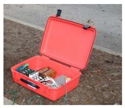
Sensor controller, location, and communication box.

Phase A of the project consisted in the development and testing of a prototype system composed of sensors that are engineered in such a way that they can be rapidly deployed in the field where and when they are needed. Each one of these sensors is also equipped with their own power supply and a GPS device to auto-determine its spatial location on the transportation network under surveillance. The system is capable of assessing traffic parameters by identifying and re-identifying vehicles in the traffic stream as those vehicles travel on top of the detectors. The system of sensors transmits, through wireless communication, real-time traffic information (travel time and other parameters) to a command and control center.