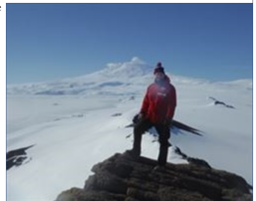
U.S. Air Force chaplain Maj. Pete Drury stands atop Castle Rock, about an eight-mile hike from the town of McMurdo, with Mount Erebus in the background. Drury completed a deployment to Antarctica in support of Operation Deep Freeze, which in turn supports the U.S. Antarctic Program scientific research efforts.