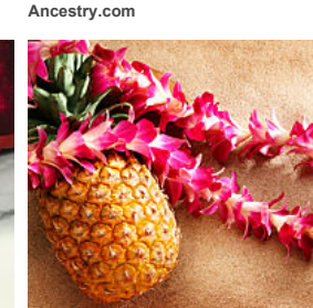
Luxury Bathroom Remodel... Easy DIY Beach Bash - Get For Less! Formica