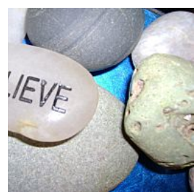
10 Empowering Beliefs That Lead You to Success GoWeLovelt.info