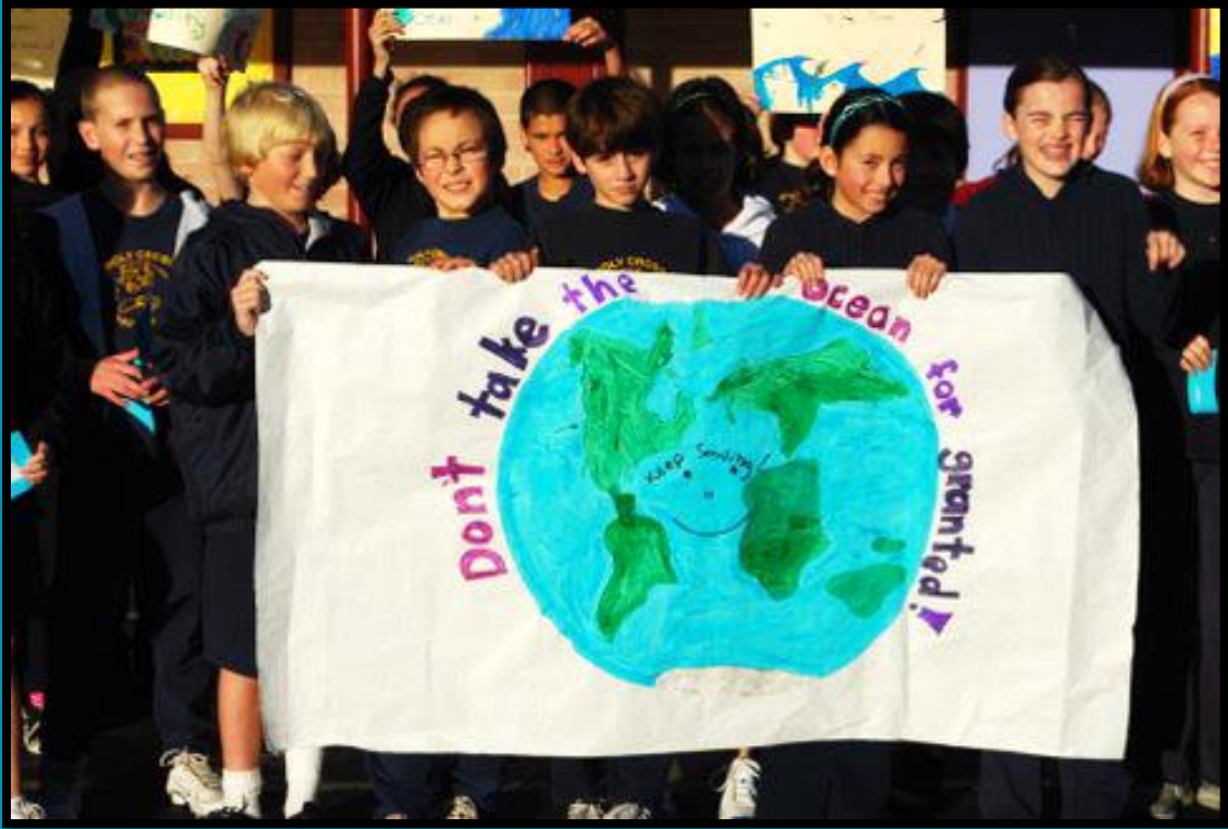
Protecting our ocean one school at a time