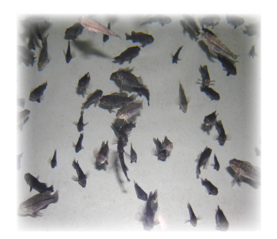
Black sea bass reared in recirculating seawater system