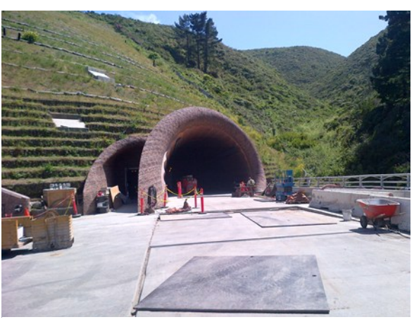
Devils Slide Tunnels

The Fire and Life Safety Division also oversaw the construction of more than 70 buildings on 250 acres known