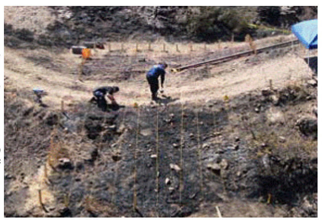
Fire Prevention Officers conducting an origin and cause investigation