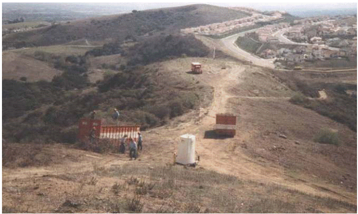
Cooperative fuelbreak - a result of community planning efforts

The Planning and Wildland Fire Prevention Program is multidimensional and the programs are interdependent. This program has four components: Planning and Risk Analysis; Investigations and Enforcement; Wildland Fire Prevention Engineering; and Civil Cost Recovery.