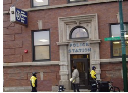
3900 South California St., Chicago, IL

Youth and families have their first contacts with the JISC at a facility on Chicago's South Side, but the JISC is not a building. It is a process. The goal of the process is to identify delinquent youth as soon as possible after they begin to violate the law and to implement services and supports that lower the chances of future crime.