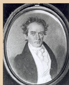
Stephen F. Austin known as the "Father of Texas."

In 1997, the Legislature established a three-member committee appointed by the Governor, Lieutenant Governor, and Speaker of the House of Representatives to oversee the Cemetery.