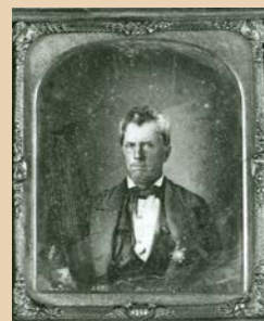
Ed Burleson soldier and statesman, was the first person buried at the Cemetery in 1851