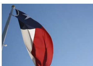
Flag – A 150 ft. flagpole marks the entrance to the cemetery and can be seen from the State Capitol.

Culturally, the Cemetery is unique because it represents every aspect of Texas history from European Colonization to modern day Texas politics. Historical and cultural icons are recognized and honored at the Cemetery. In addition to the prominent Texans buried here, many are represented by cenotaphs (a memorial marker). Individuals with cenotaphs include Susanna Dickinson, Alamo survivor; James Michener, Pulitzer Prize winner; Tom Landry, legendary coach of the Dallas Cowboys; and United States Senator John Tower.