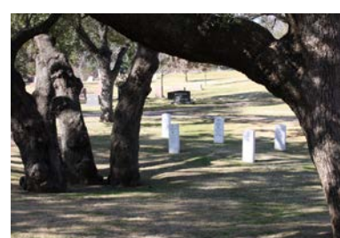
Medal of Honor Section – This section is dedicated to Texas Medal of Honor recipients.