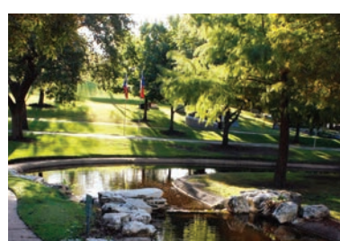
Pond – The Pond runs through the center of the grounds and is lined with stones from Salado, Texas.