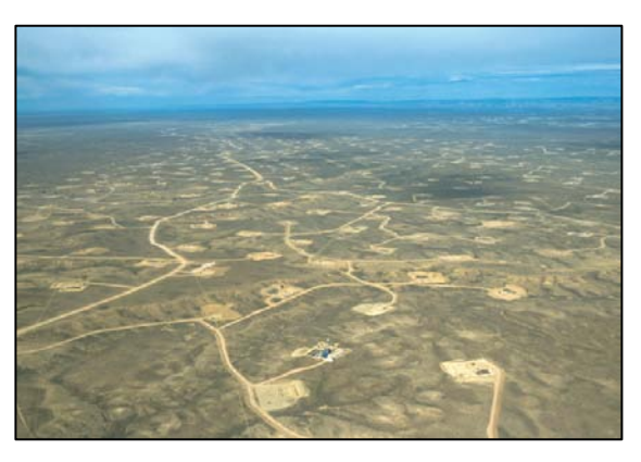
Drilling in the Upper Green River Valley, Wyoming Peter Aengst

The public lands of the Rocky Mountain West— Montana, Wyoming, Colorado, Utah, and New Mexico—harbor some of the most spectacular and wildlife-rich landscapes in America. These lands also harbor prodigious amounts of natural gas resources, the development of which has brought both economic activity and environmental degradation to the communities of the region. Currently about 15 percent of U.S. natural gas production derives from federal onshore lands,<sup>1</sup> and a rush towards more natural gas production across the country is expected as unconventional shale plays become economically developable.