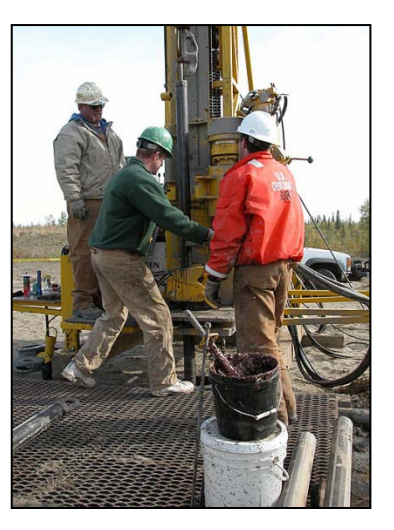
Workers on a natural gas rig

Oil and gas development often results in economically unstable communities due its boom and bust nature.<sup>24</sup> Some of this instability is due to the tendency for the industry to engage in rapid development over a large scale which has myriad impacts on community economic and social indicators. For example, the high wages paid by the natural gas companies during booms make it difficult for established small non-energy businesses and local governments to find workers.<sup>25</sup> Social problems develop from a sudden influx of workers migrating into the area during "boom" times.<sup>26</sup> Drilling booms force local governments to spend more to provide basic services for a rapidly growing population.<sup>27</sup> Oil and gas drilling also results in increased per capita emergency service demands, which also increases the need for public funded services.<sup>28</sup> All of these problems are exacerbated by the rapid pace