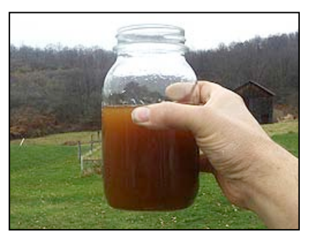
Polluted water in Pennsylvania Darrell Smitsky

not regulated under the federal Safe Drinking Water Act. This exemption was granted by Congress in 2005, at the behest of the oil and gas industry. Unfortunately, natural gas companies and their service operators also are not required to publicly disclose the chemical compounds that they inject underground, many of which are harmful to health and some of which are known carcinogens.<sup>20</sup> Complaints of well and drinking water contamination after hydraulic fracturing has occurred are surfacing around the country.<sup>21</sup>