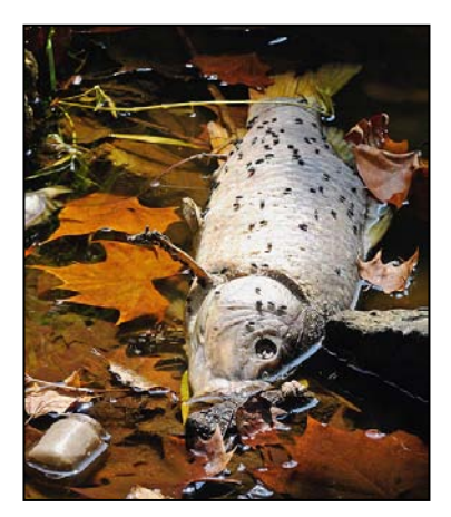
Fish killed in spill in Pennsylvania

Natural gas extraction, particularly when carried out with hydraulic fracturing, has major impacts on water resources, in terms of the amount of water used, chemicals added, and wastewater that both remains underground and returns to the surface. Hydraulic fracturing is a drilling process that uses millions of gallons of water combined with sand and tens of thousands of gallons of chemicals for each well drilled to create underground fractures that allow natural gas to be removed. The technique is used in over 90 percent of wells across the country,<sup>17</sup> most frequently in geologic formations like shale plays, tight sands, and coalbeds.