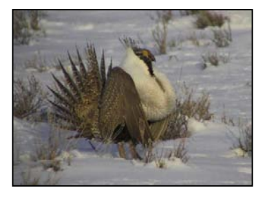
Greater Sage-grouse Idaho Fish and Game

Many places where intensive gas drilling takes place are also home to vital keystone species. The Greater Sage-grouse, an important game bird that inhabits the sagebrush steppe habitat of the Rocky Mountain West, is a prime example of the negative consequences to iconic species that arise from natural gas drilling. One government report details the specific impacts and ongoing decline of sage-grouse from oil and gas development.<sup>14</sup> The species has disappeared from nearly half of its historic range due to habitat fragmentation and other disturbances, and the Department of the Interior last year listed the species as a prime candidate for protection under the Endangered Species Act.<sup>15</sup> Oil and