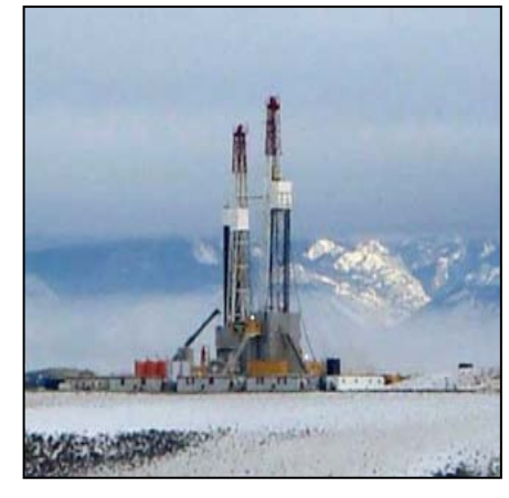
Energy development in Wyoming Bureau of Land Management

Ground level ozone (a major component of smog) concentrations in some Western communities have risen spectacularly with the advent of intense natural gas development. For example, Sublette County, Wyoming—a rural community where more than 3,100 wells were drilled between 2000-2009—went from regular background levels to levels exceeding those of Los Angeles and Houston in 2008, all as a consequence of natural gas development.<sup>6</sup> In early 2008, the Wyoming Department of Environmental Quality issued several health alerts for the county after recording ozone levels significantly above federal health standards.<sup>7</sup> As former Wyoming Governor Dave Freudenthal put it, "The State of Wyoming is ... challenged by the need to reduce emissions from the natural gas industry ... "<sup>8</sup>