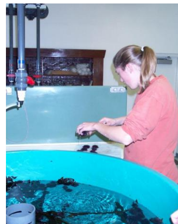
Figure 1. S. purpuratus fertilization test

Toxicity tests or “bioassays” have been utilized for well over a century, with one of the first known studies dating back to 1863. In this pioneering report, researchers Penny and Adams examine the impacts of various industrial chemicals on the aquatic biota of several Scottish rivers by subjecting goldfish and minnows to spiked ambient water samples. Other toxicity studies were published sporadically until the practice became more widespread in the 1920s. State and federal agencies began adopting the practice in the 1930s, with standardized methodology first published in 1960 (Tarzwell 1978). It is interesting to note that, while test methodology has evolved since Penny and Adam conducted their experiments, the basic structure of their test design is reflected in modern-day toxicity tests.