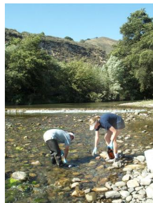
Figure 3. Ambient water sampling

Toxicity testing is also an integral component of ambient monitoring studies. The following is a selection of past and present SWAMP projects investigating toxicity in California’s surface waters.