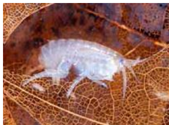
Figure 2. H. azteca (amphipod)

Once a toxicity test has concluded, the results are analyzed using a statistical approach. These analyses generally fall into one of two categories: hypothesis tests and point estimates. Hypothesis tests answer the question, "Does a critical concentration of the sample show a statistically significant decrease in organism response as compared to the control?" Hypothesis Tests are used to analyze data from both multiple- and single-concentration toxicity tests. For multiple concentration test, hypothesis tests such as Dunnett's and Steel's Many-One Rank Tests are used to determine the "no observed effect concentration" (NOEC) and the "lowest observed effect concentration" (LOEC) endpoints. For single- concentration tests, the absence or presence of a statistically significant response is denoted with a "pass" or a "fail" endpoint, respectively. These endpoints are calculated using a t-test or the Test of Significant Toxicity (TST).