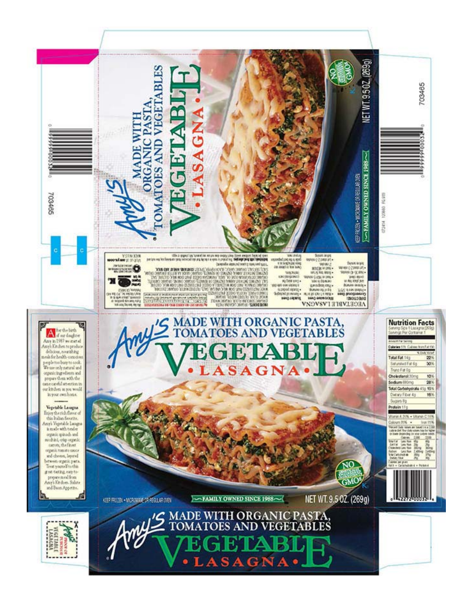
# # #