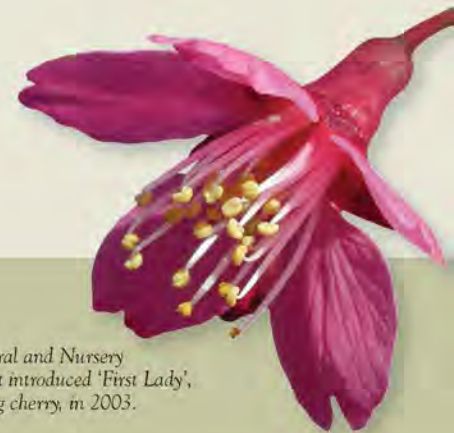
The arboretum's Floral and Nursery Plants Research Unit introduced 'First Lady', a dark pink flowering cherry, in 2003.