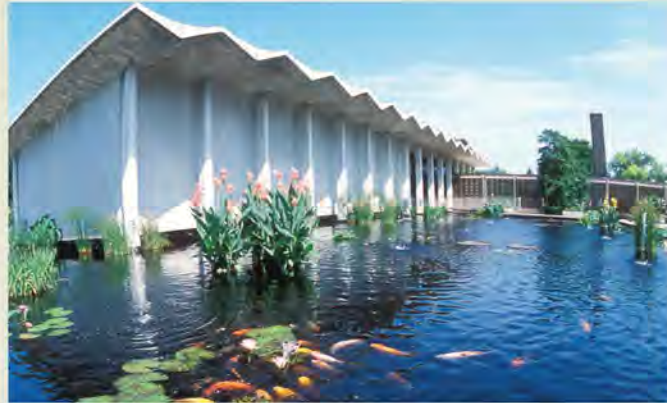
The design of the 1960s Administration Building echoes the upright and branching structure of trees.

In case of emergency, contact Security at (202) 245-4572.