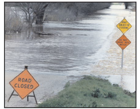
Flood Awareness Month, May 2001, provides an opportunity for the OWRB and other state organizations to educate Oklahomans about numerous flooding dangers, including driving into flooded roadways.

"More people drown in their cars than anywhere else," Morris pointed out. "Currents can be deceptive; just several inches of moving water can pick up or