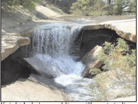
Knight Lake's crumbling spillway is indicative of numerous deficiencies in the west Oklahoma City dam.

At its May meeting, the nine-member Water Board voted to seek relief in Oklahoma County District Court to compel repair of dilapidated Knight Lake dam, in Oklahoma City. To date, owners of the deteriorated structure have failed to comply