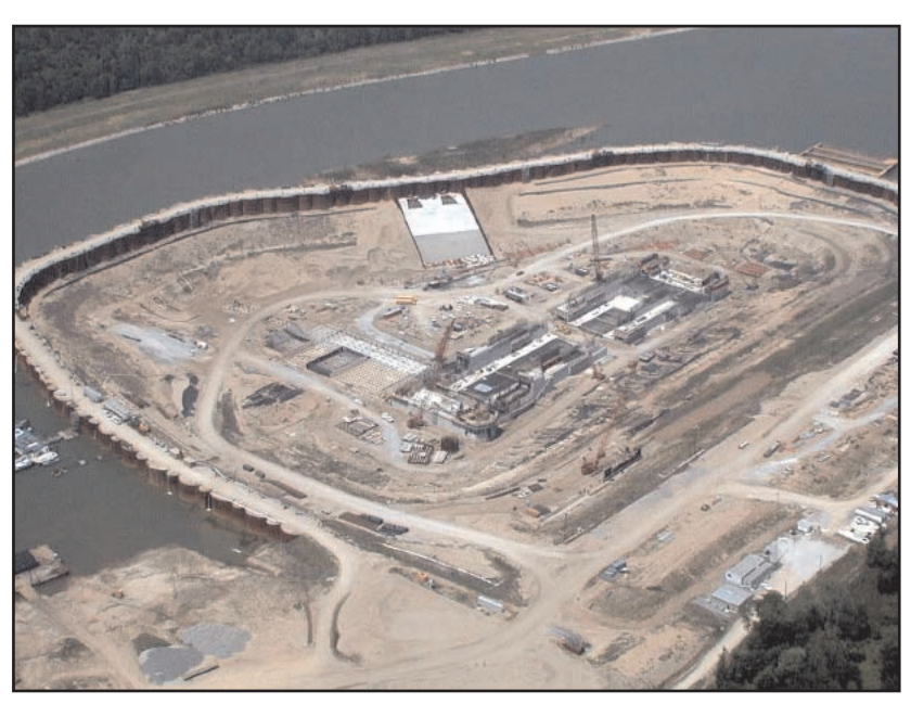
An aerial view of construction on Montgomery Point Lock and Dam.