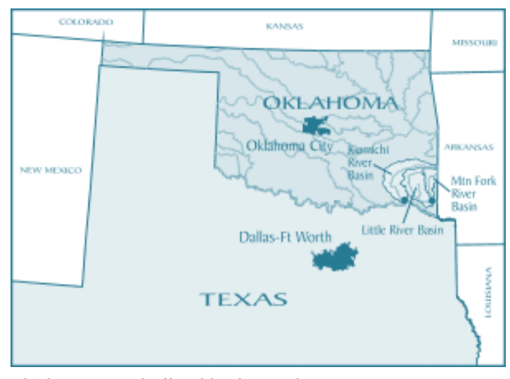
The last proposal offered by the North Texas Water Agency included a three-phase plan to transport up to 320,000 acrefeet of water per year from the Kiamichi, Little, and Mountain Fork River Basins to users in Texas.