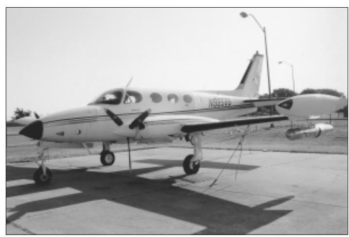
High-performance aircraft are one of the many state-of-the-art tools employed in the Oklahoma Weather Modification Program.

funds. The OWRB and Oklahoma Weather Modification Advisory Board, who oversee and direct the program, continue to investigate long-term funding sources for the effort, which seeks to augment rainfall and prevent hail damage throughout the State.