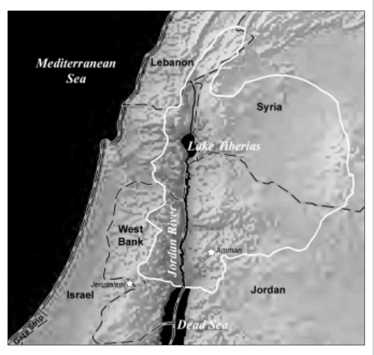
The Jordan River watershed is delineated in white (left). Most of the river's flow is contributed upstream of Lake Tiberias. Many residents of the lower Jordan River Basin rely upon large aquifers underlying much of the West Bank region.

While water supply is the consortium's prominent goal, establishment of trust among participants will likely be the determinant of success, according to former U.S.