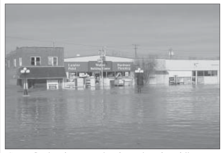
Severe flooding from more than five inches of rainfall on March 4 damaged some 278 residences, businesses, and other structures in the Town of Kingfisher. Water rose to nearly five feet in some areas of the community.

In April, the Governor signed legislation establishing accreditation standards for Oklahoma's floodplain administrators. The OWRB will administer the training accreditation provisions of the new law, House Bill 2284, which was introduced this session by Representative Thad Balkman and Senator Bruce Price. The bill will play a vital role in floodplain management