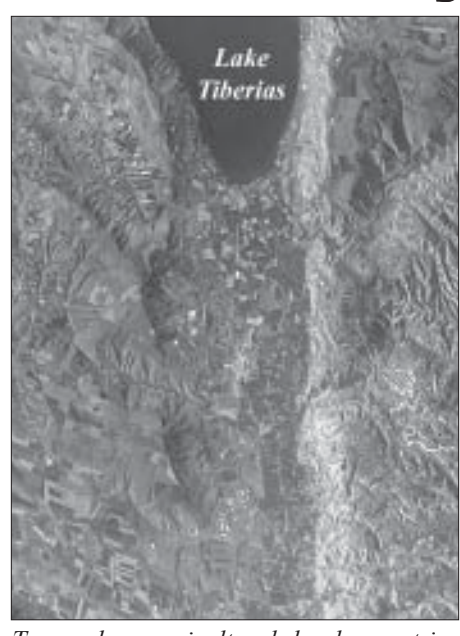
Tremendous agricultural development is evident around and immediately downstream of Lake Tiberias (above). The flow of the Jordan River is barely discernible in this NASA satellite image.

"During the Dead Sea meeting, it struck me that these are many of