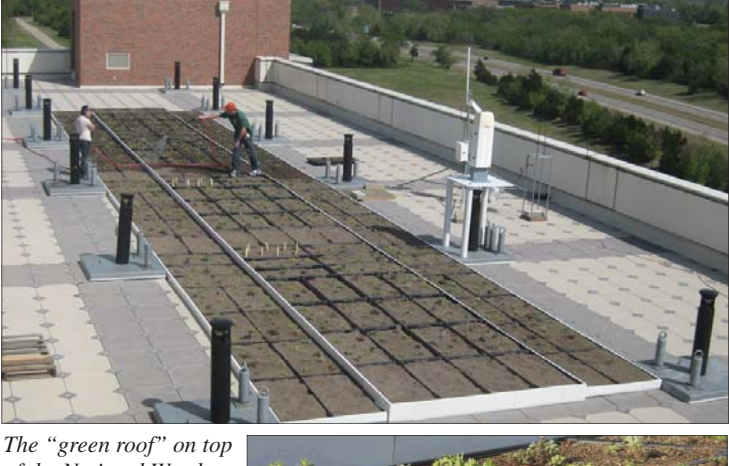
of the National Weather Center in Norman. Eventually, the young sedums and other hardy plants will cover the planting area.

systems intercept solar radiation, cooling structures during the summer months and reducing air