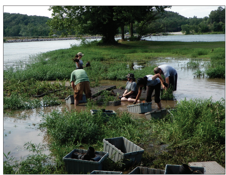
More than 4,000 wetland plants were established at Lake Eucha on 3,200 square feet of floating islands consisting of recycled plastics. These plants will provide valuable habitat for birds, fish, and aquatic insects while reducing nutrients in the water column.

Lakes and Special Studies staff continued to work cooperatively with the Central Oklahoma Master Conservancy District to monitor and improve water quality in Lake Thunderbird where a new system to oxygenate lake water was implemented. The OWRB