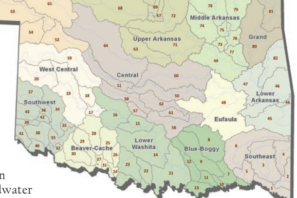
OCWP Watershed Planning Regions & Basins

The OCWP evaluated the impacts of forecasted demands on the physical availability of Oklahoma's surface and groundwater supplies through the next 50 years. More specifically, utilizing a suite of planning tools, the OCWP predicted the amount, timing, frequency and probability of potential water shortages. A number of planning