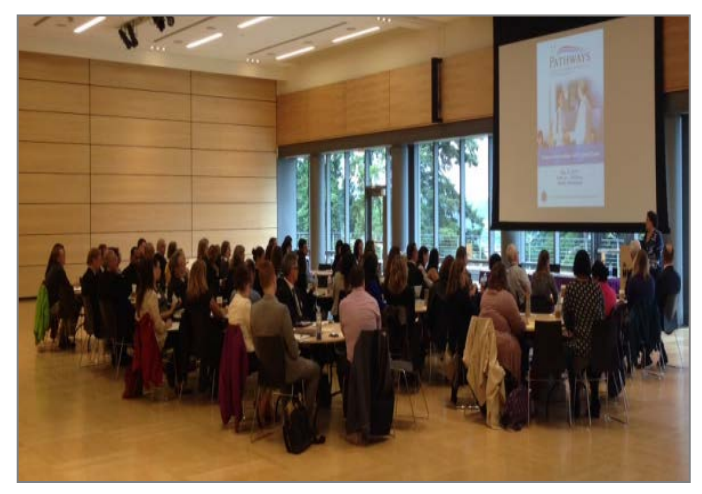
REDI Initiative full-day event (Seattle FEB)

✓ The Seattle FEB supported OPM's Recruitment, Engagement, Diversity and Inclusion (REDI) initiative with a full-day event. It provided information for Federal agencies and local colleges on best practices to attract and recruit students and recent graduates through OPM's Pathways Programs. The event included a facilitated discussion on methods to improve partnerships between Federal hiring managers, human resources officials, and university career services staff and faculty. A simultaneous session was held for students on the Pathways Programs with an option to join the session virtually. Survey results stated that 89% of the attendees rated the sessions highly and would recommend the event to others.