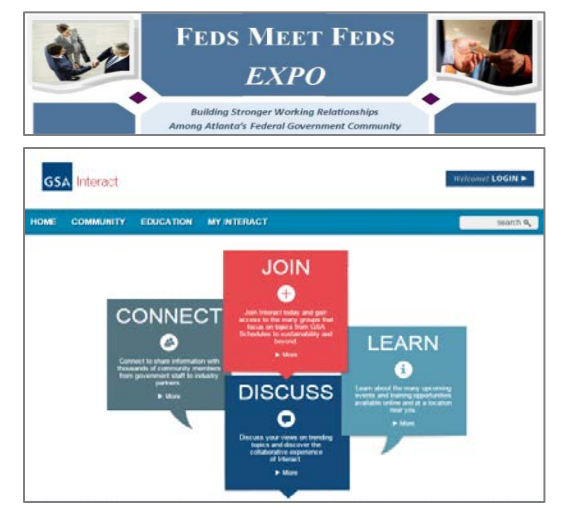
Feds Meet Feds Expo/GSA Interact platform (Atlanta FEB)

✓ Atlanta FEB's Leadership Development Program organized a Feds Meet Feds Expo which included information tables and displays from 55 Federal agencies showcasing their missions and initiatives. The event included a panel of Regional Administrators, as well as a Congressional keynote speaker. The Feds Meet Feds Expo created networking opportunities among Federal employees, promoted interagency collaboration, and increased awareness of the Atlanta FEB's outreach to the local community. Additionally, the General Services Administration (GSA) introduced its new platform, GSA Interact, during the Expo. GSA Interact is a virtual resource for Federal agencies to collaborate and share information through threaded discussions around key initiatives. The Atlanta FEB is using GSA Interact to inform member agencies of upcoming FEB events, weather advisories, and Board meetings.