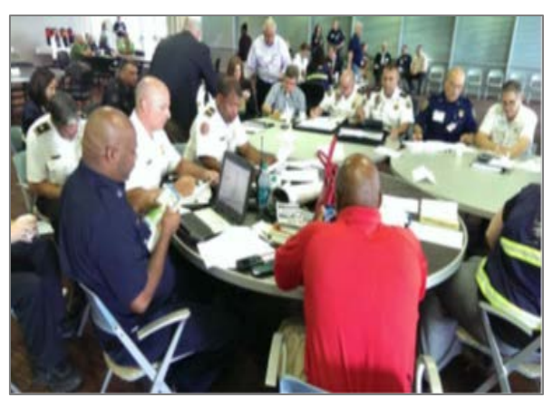
Crescent Shield TTX (New Orleans FEB)