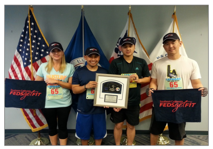
U.S. Customs and Border Protection's team won first place in its division for the annual Baker to Vegas relay race.

Acquisition Councils – Dallas-Fort Worth, New Mexico, Philadelphia, and San Francisco FEBs created new acquisition councils designed to improve networking, showcase best practices and innovative solutions, and provide acquisition training opportunities.