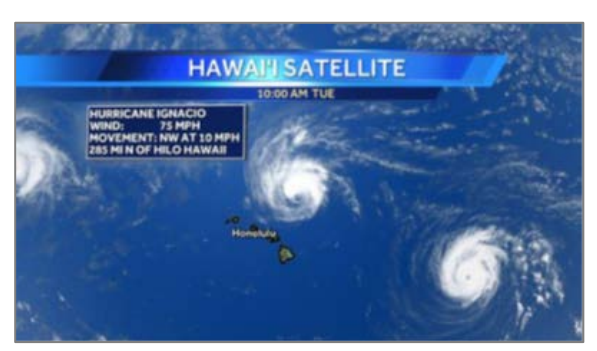
Hurricane Ignacio (Honolulu FEB)