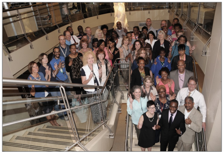
Tutoring Committee at VA Medical Center (Cleveland FEB)

✓ The Boston FEB started a new outreach program called "Promising Pals" which recruited 49 Federal employees to exchange letters with middle school students. Promising Pals bridges generations by matching adolescent students with an adult pen pal. The Cleveland and Colorado FEBs continued to sponsor tutoring programs for local elementary, middle, and junior high schools. These programs resulted in increasing student proficiencies in both math and reading. Other FEBs with outreach programs to local grade schools include: Cincinnati, Los Angeles, Minnesota, New Orleans, San Antonio, San Francisco, and South Florida.